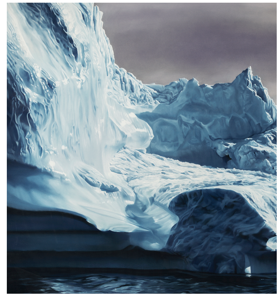
Zaria Forman: 'Greenland #63', Paste on Paper, 50"x75"

Zaria: The inspiration for my drawings began in my early childhood when I travelled with my family throughout several of the world's most remote landscapes, which became the subject of my mother's fine art photography. I developed an appreciation for the beauty and vastness of the ever-changing sky and sea. I loved watching a far-off storm on the western desert plains; the monsoon rains of southern India; and the cold Arctic light illuminating Greenland's waters.